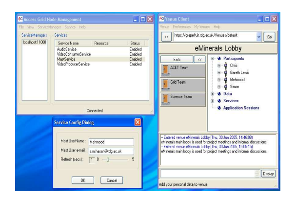
Figure 3: Screen shot showing MastService enabled on a node and the MAST configuration options on a Windows machine

The MAST application must also be adapted to work with the MAST Service and accept the command line arguments in the format "multicast address/port". This information is used to automatically connect to the correct multicast group when a client enters a new Venue. In such a situation, the MAST menu items used for opening saved connections and creating new connections are disabled to ensure that control of an application's connection is exclusively restricted to the Venue Server.